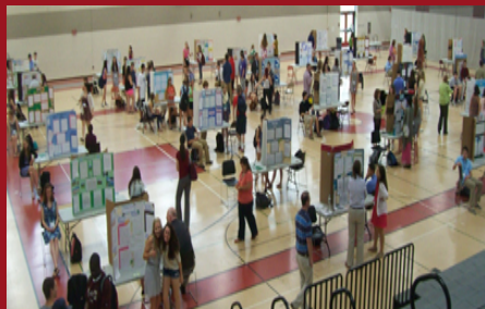
Senior Internship Exhibition

The Senior Internship Program is available to qualified seniors during fourth quarter of the senior year. Usually, over 90% of the senior class will participate. Students are encouraged to find an internship in a field of their choice, while others choose to design an independent research project. Recent internship placements include the Massachusetts State House, the Boston Common Magazine, Lahey Clinic, Genzyme Biotech Company, Massachusetts Audubon Society and the North Shore Navigators. English and elective credits are earned to satisfy the graduation requirements. Students write a paper based on their experiences and share their experience through an oral presentation.