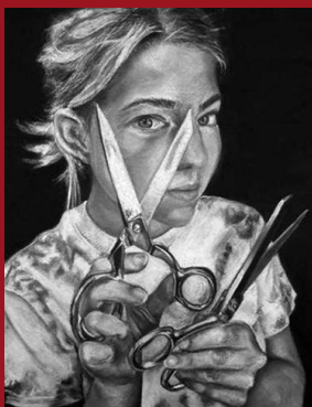
Student work cited as an "American Visions Nominee" for Gold Key winning drawing "Scissors", which is one of five pieces selected as "Best in Show" from across the state.

ARTS: The Masconomet Art Department has gained a national reputation for outstanding achievement through the accomplishments of its students and faculty. We take pride in our solid program, which not only emphasizes the making of art and solving complex visual patterns, but also encourages the ability to discuss art. The art program is open to all students of varying levels of ability and experience. We have a four year sequential program culminating in AP Studio Art in addition to a varied elective program offering over 20 selections exploring new and emerging media. Historically, Masconomet students have been awarded the greatest number of prizes in the Boston Globe Scholastic Art Awards program of any school in the state.