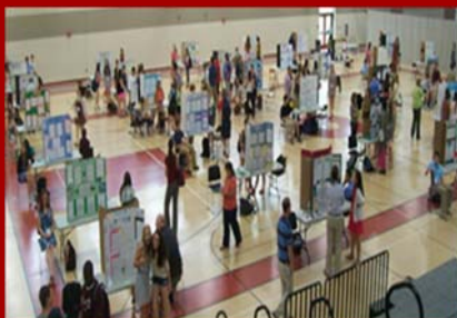
Senior Internship Exhibition

The Senior Intern Program is available to qualified seniors during fourth quarter of the senior year. Usually, over 95% of the senior class will participate. Students are encouraged to find an internship in a field of their choice, while others choose to design an independent research project. Recent internship placements include the Massachusetts State House, the Boston Common Magazine, Lahey Clinic, Genzyme Biotech Company, Massachusetts Audubon Society and the North Shore Navigators. English and elective credits are earned to satisfy the graduation requirements. Students write a paper based on their experiences and share their experience through an oral presentation.