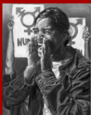
Scholastic Art and Writing Gold Key award winning drawing "Speak Up" from 2020 .

ARTS: The Masconomet Art Department has gained a national reputation for outstanding achievement through the accomplishments of its students and faculty. We take pride in our solid program, which not only emphasizes the making of art and solving complex visual programs, but also encourages the ability to discuss art. The art program is open to all students of varying levels of ability and experience. We have a four year sequential program culminating in AP Studio Art in addition to a varied elective program offering over 20 selections exploring new and emerging media. Historically, Masconomet students have been awarded the greatest number of prizes in the Boston Globe Scholastic Art Awards program of any school in the state.